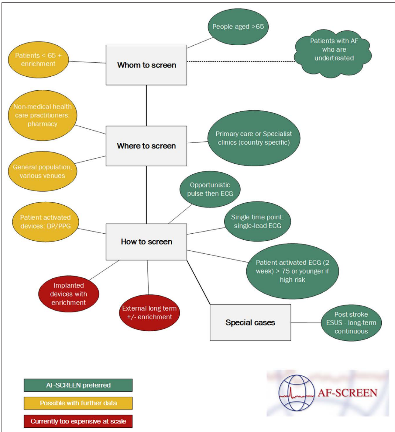
Figure 3. Diagrammatic representation of key points on screening.

Enrichment is the use of additional risk factors or biomarkers to either increase the proportion with unknown AF in the screened population or increase the risk of stroke in those with AF detected by screening in that population. Patients who are undertreated are patients with known AF who are not receiving oral anticoagulant according to guidelines. (see page 1859 section, Screening for Undertreated Known AF). Although this is not strictly speaking screening, such patients will be detected by population screening for AF, so this has been placed in a different shape with a dotted line connector. BP indicates blood pressure; ESUS, embolic stroke of uncertain source; and PPG, photoplethysmography.